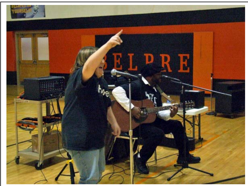
Also, the Blennerhassett School in Parkersburg, WV, and in Wood County, at the Belpre Elementary School, Belpre, Ohio and later at The Washington County Juvenile Center in Marietta.